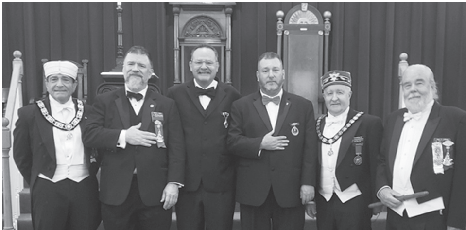
The installing team and newly installed Heads of the Bodies at the Valley of Salem Installation of Officers in September.